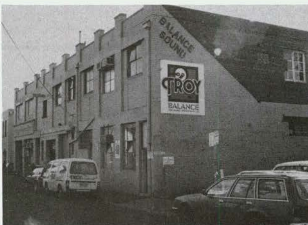
The Union street, South Melbourne HQ ▲

back! Along the way they can outfit their home studio and buy their own PA equipment, because upstairs is a showroom with Soundcraft, E.V., Yamaha, JBL & Jands all represented by means of actual stock on the floor. A Sydney branch offers Hire & Sales.