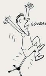
Don't jump on the monitors or their owner may find a new place to store your mic stand!